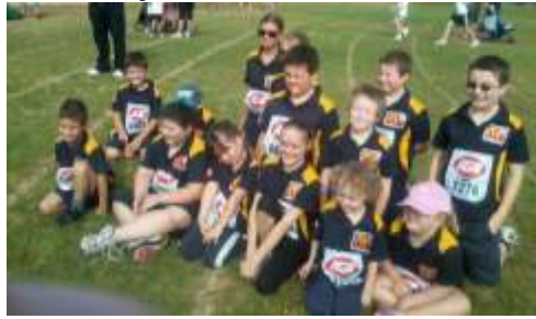
Little Athletics SA Northern Country Regional Games Port Wakefield Little Athletics (Adelaide Plains Giants) group again did us proud by taking out the trophy.