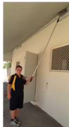
Primary School students assist with hall cleaning.