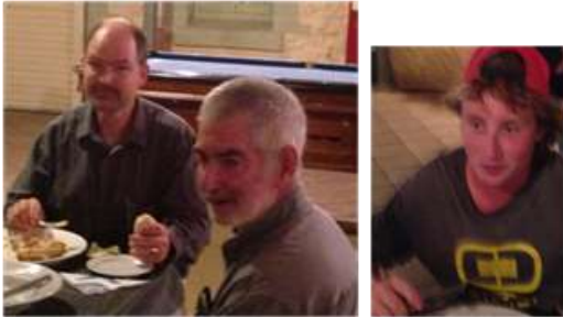
The Marine Park 14 Action Group gathered at the Rising Sun Hotel on Tuesday 18 March as a 'get together' and to contemplate the outcome of the State Election.