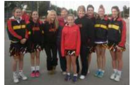
The Hummocks girls who were selected to play Country Champs for the Adelaide Plains Netball Association over the June long weekend at Stadium SA: