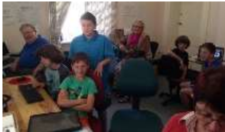
Busy Session at Community Computing during school holidays.