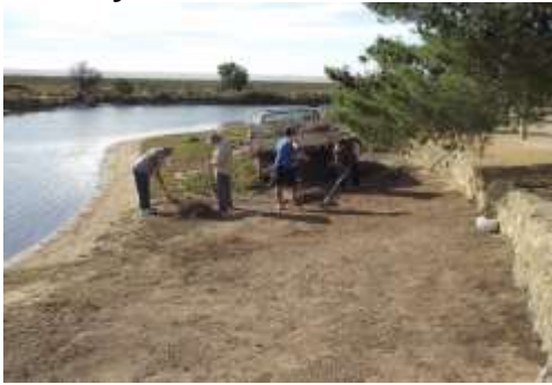
Clean Up at the pool.