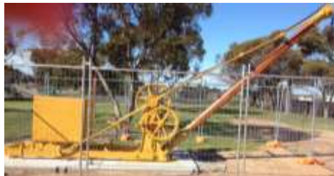
The crane, originally from the wharf, has been restored and placed in the park area on the corner of Mine Street and Wharf Reserve.