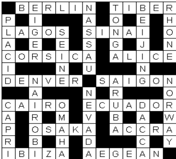
Answer Xword 3

Sphinx answer- Man, he crawls on all fours as a baby, then walks on two feet as an adult, and then walks with a cane as an old man.