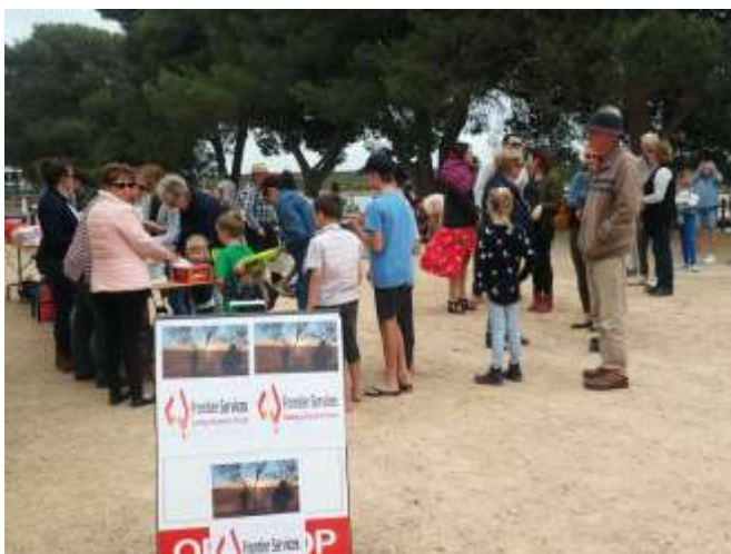
Lining up for lunch.