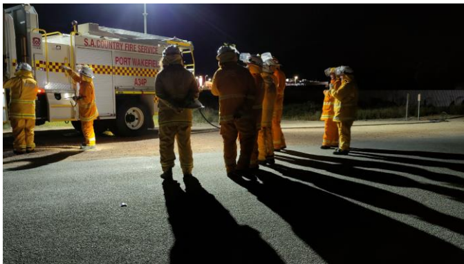
Burnover training.

In preparation for fire season, our CFS members have completed their burnover training.