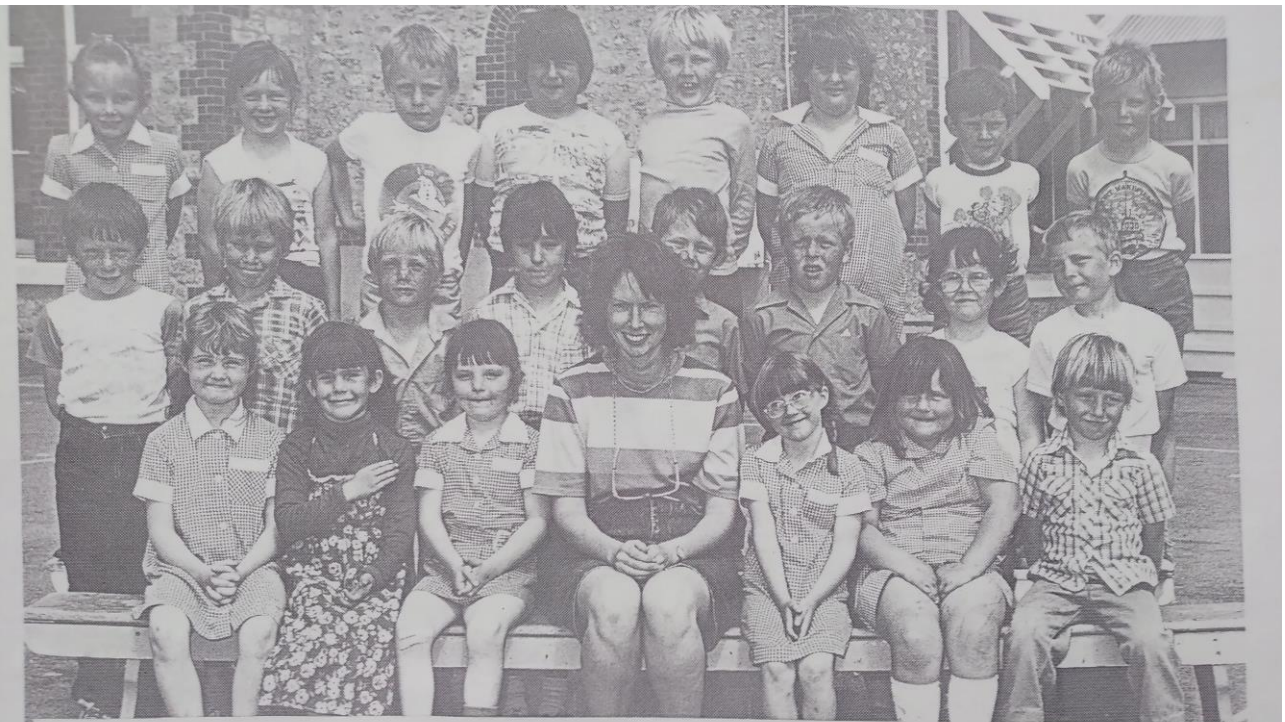
YEAR RECEPTION, 1 & 2 - 1985.